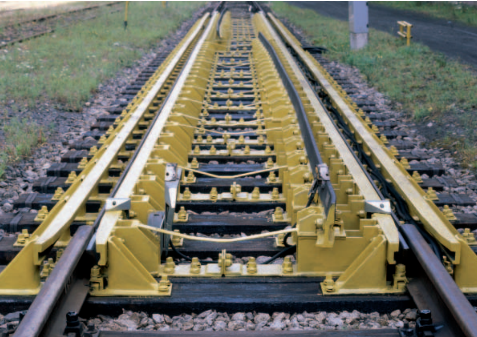
Automatic gauge changing facility from ZNTK

Five different power systems and 15 different train control systems as well as five different track gauges in Europe and Asia regularly cause delays in cross-border rail traffic. Due to differing technical standards, the engine and – if the other country uses a different gauge – the bogies of the cars often must be changed at borders, causing extra costs and delays. Automatic gauge changing facilities