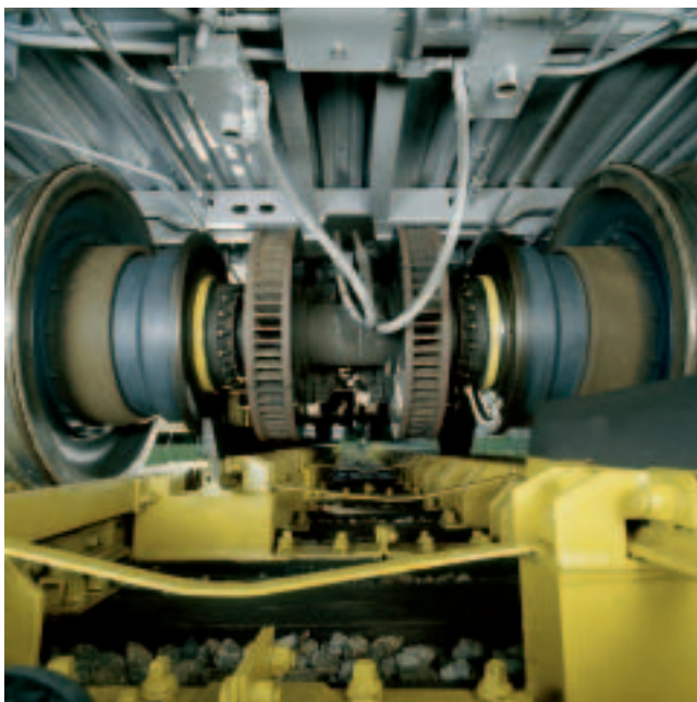
Gauge changeover system