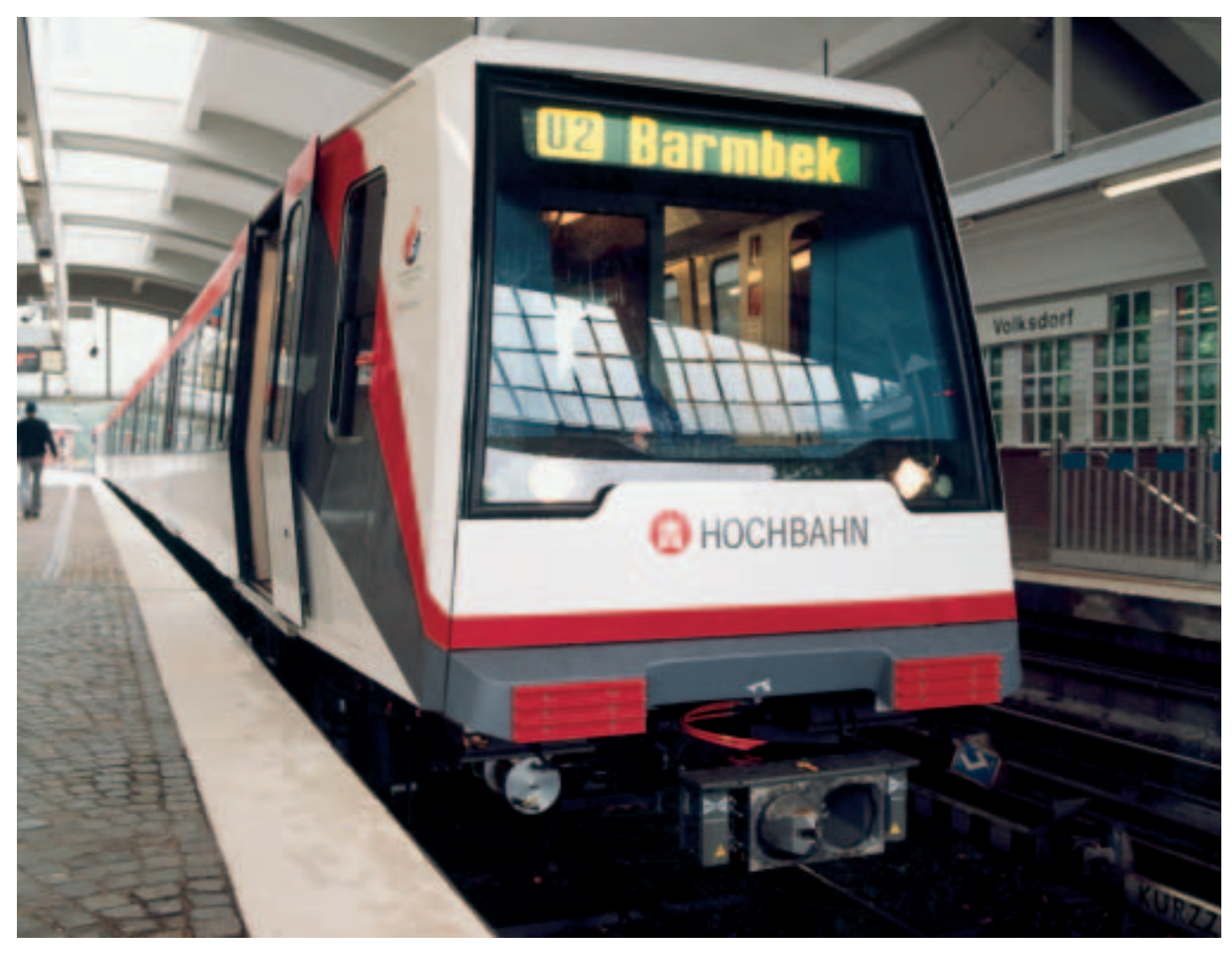
Hamburger Hochbahn (Aerial Railway) type DT4: Designed and built by ALSTOM LHB and BOMBARDIER TRANSPORTATION

The DT4-type, three-phase driven underground trains consist of four non-separable carriages. Each vehicle is equipped with 4 motor and 2 trailer bogies.