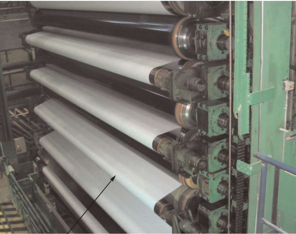
Calender with guide rolls

Guide rolls turn the paper web as it passes through a calender. Depending on the specific requirements, a calender consists of 8 to 14 rolls for smoothing the paper surface.